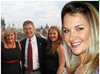
• Agony of flesh-eating bacteria victim: Woman who lost four...