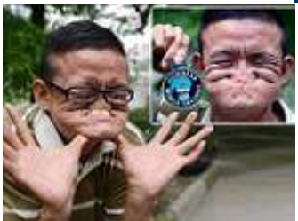
• He is ugly! World's greatest 'gurner' offers £10,000 reward...