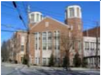
• Teachers at elite New York City prep school accused of...