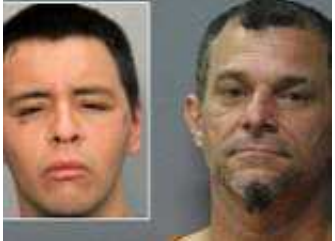
• Is Cloud Nine behind the 'zombie apocalypse'? Police issue...