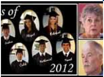
• SEVEN siblings graduate high school with honors at the same...