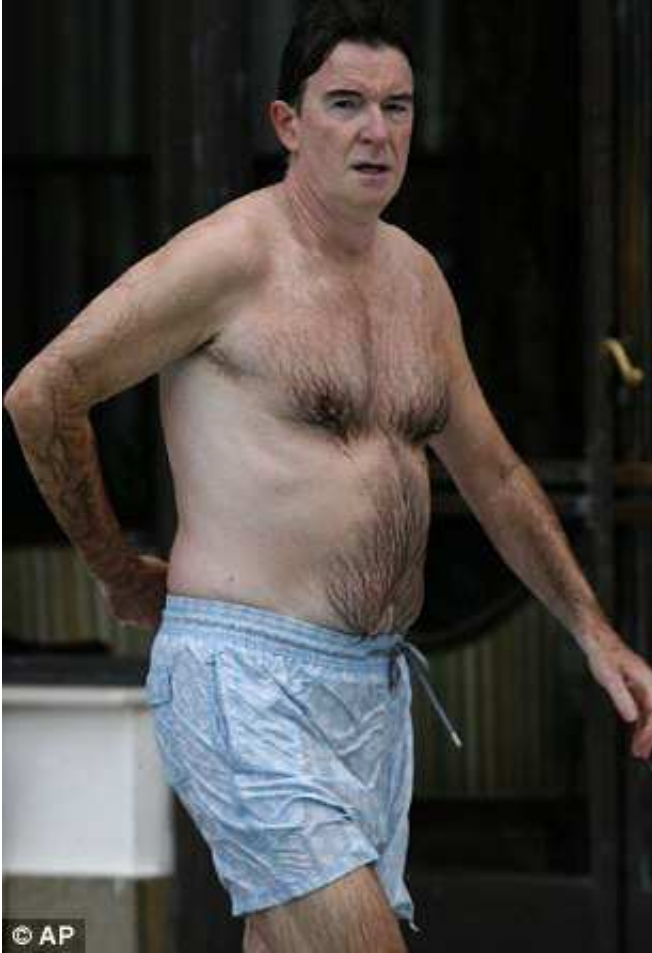
Friends in high places: Lord Mandelson has also vacationed on Epstein's island

'One was definitely under age, but she had a letter of consent from her parents and was under the guardianship of a model agency,' he says.