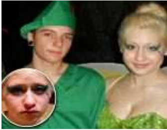
• Teen dressed as Tinkerbell breaks down in tears after being...